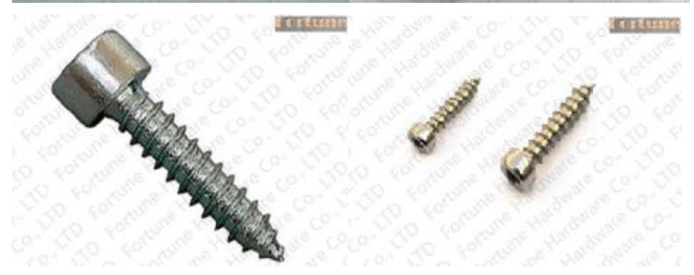
You can refer to below chart/list of Screw head/Thread ending